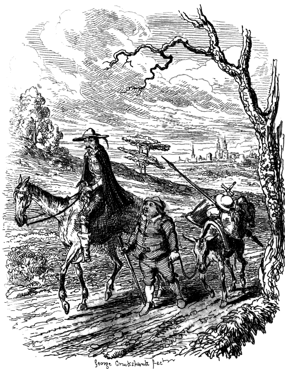
Don Quixote & Sancho returning home.

Published by Charles Tilt, Fleet Street, London.