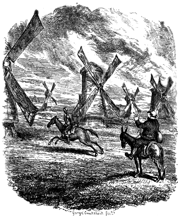
The Don attacking the Wind Mills.

Published by Charles Tilt, Fleet Street, London.