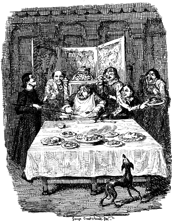
Sancho in his Governorship.