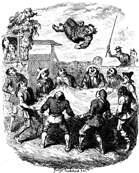
Tossing Sancho in a blanket.

Published by Charles Tilt, Fleet Street, London.