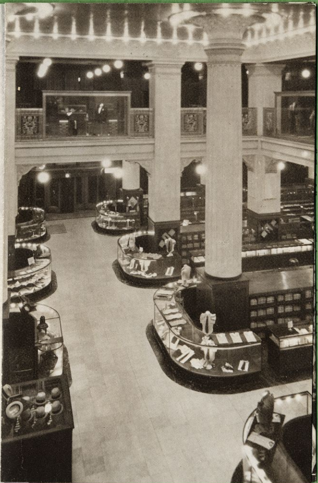
MARSHALL FIELD & COMPANY, CHICAGO