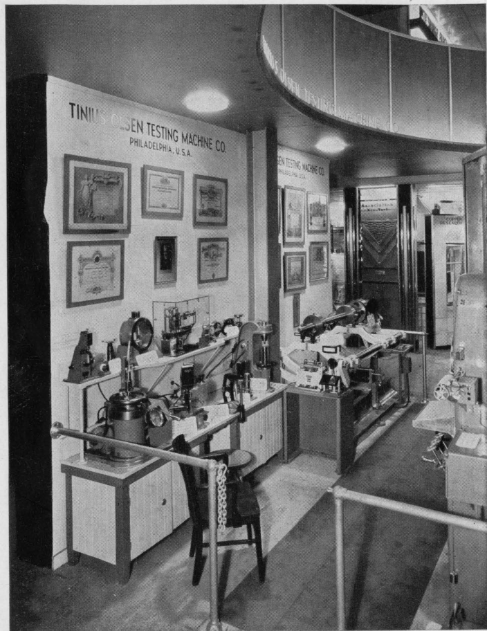
Tinius Olsen Testing Machine Company Exhibit (View from Front)

TINIUS OLSEN TESTING MACHINE COMPANY 500 North 12th Street « « Philadelphia, Pa