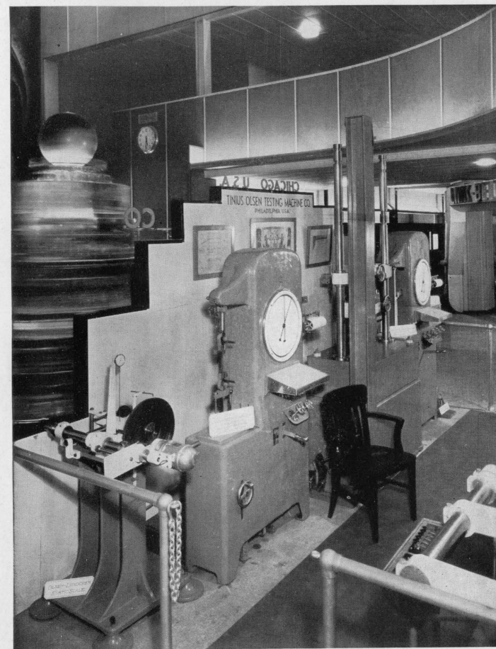
Tinius Olsen Testing Machine Company Exhibit (View from Rear)