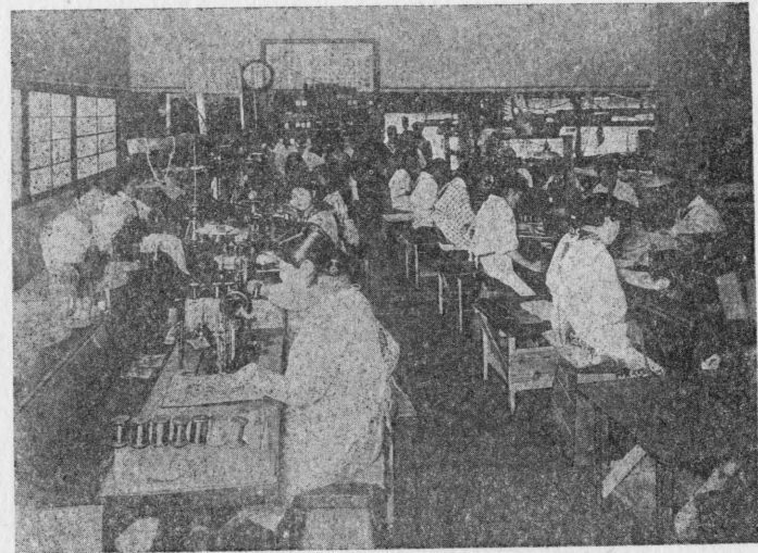
Manufacturing of Table Cloths.