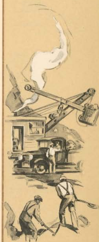
Helps Build the Community

Or perhaps the money was loaned to a railroad to improve equipment, construct better freight terminals, or for that new passenger station much needed by the community. When you travel, then, you use equipment which your life insurance funds helped to secure. Again, these same funds have a part in hauling your daily food supply, in transporting all the products that come to you