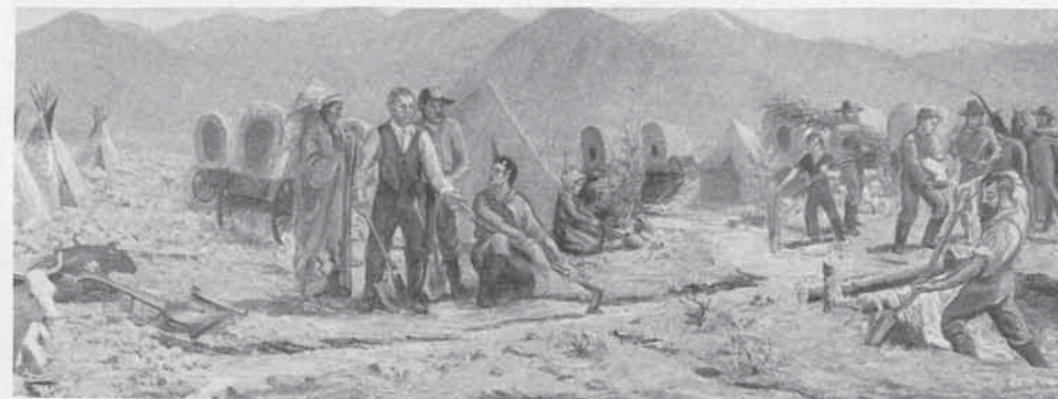
First Irrigation of Anglo-Saxons in America

"The Pioneers Entering Salt Lake Valley" is a beautiful picture of the desert with the salt sea and mountains in the background.