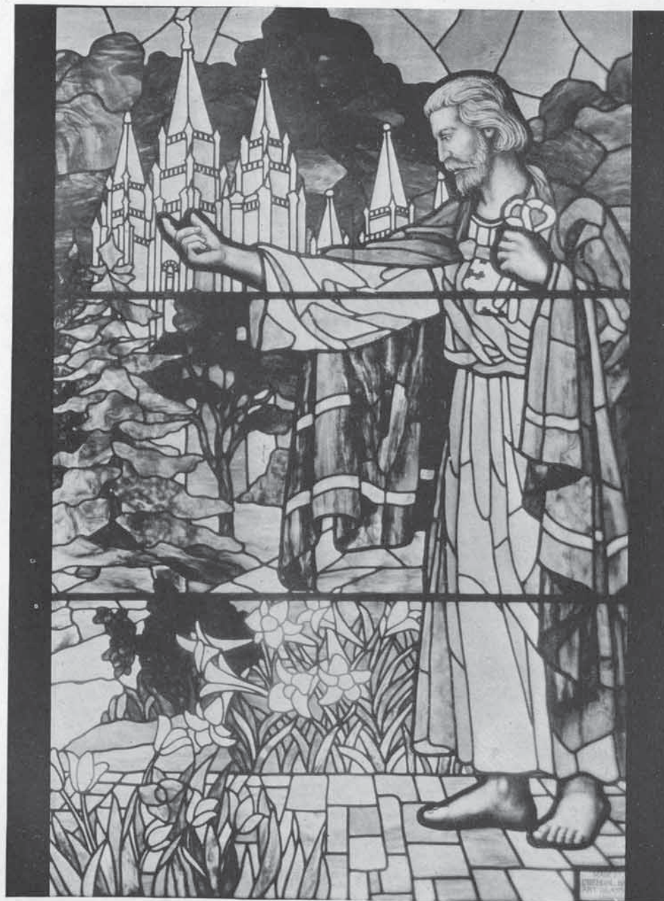
In Holy Temples