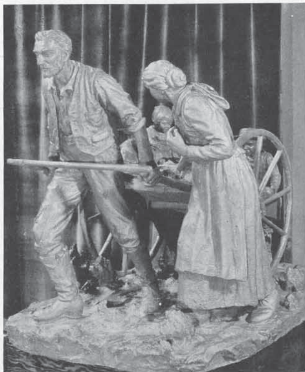
The Handcart Company

Published by NORTHERN STATES MISSION of the CHURCH OF JESUS CHRIST OF LATTER-DAY SAINTS 2555 North Sawyer Avenue, Chicago, Ill.