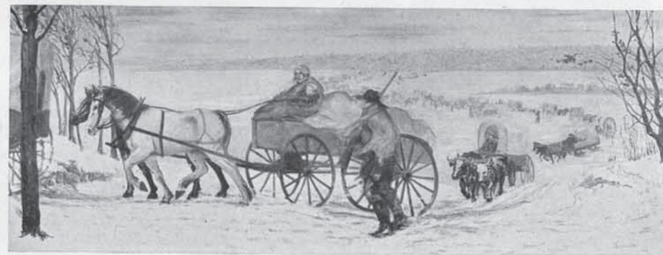
Exodus From Nauvoo, Illinois