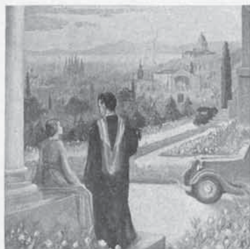
The Desert Shall Blossom as the Rose

The "First Winter in the Valley" was a trying time. The courage and fortitude of the strongest was tested to the bitter end. During those first years in the valley the pioneers were forced to undergo extreme hardships. The country was barren and a forbidding one in which to try to produce crops. In order to make it possible to plow the land and plant the crops, and give sufficient moisture, the people resorted to what is now known as irrigation. They placed obstructions or dams in the streams that came down from the mountains, and spread the water over the land. This picture of "The First Irrigation of Anglo-Saxons in America" will undoubtedly live as a master-piece.