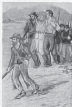
The Mormon Battalion

development are fundamental factors on the road to progress. The sun, moon, and stars are symbols of "Eternal Life." These express "Degrees of Glory" to which we may attain.