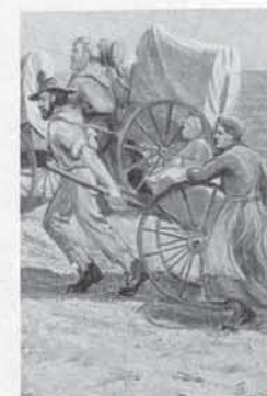
The Handcart Company

At the left of the family group is represented Creative Recreation. The girl with the harp symbolizes not only love of music but the work of the auxiliary organizations in the Church which are established for the purpose of giving opportunities of expression in this divine art. The same can be said of the other figures of this group which represent the plastic arts, Literature, and Drama. Continuous activity along these lines is found among the members of the Church and in their organizations. Recreation and cultural