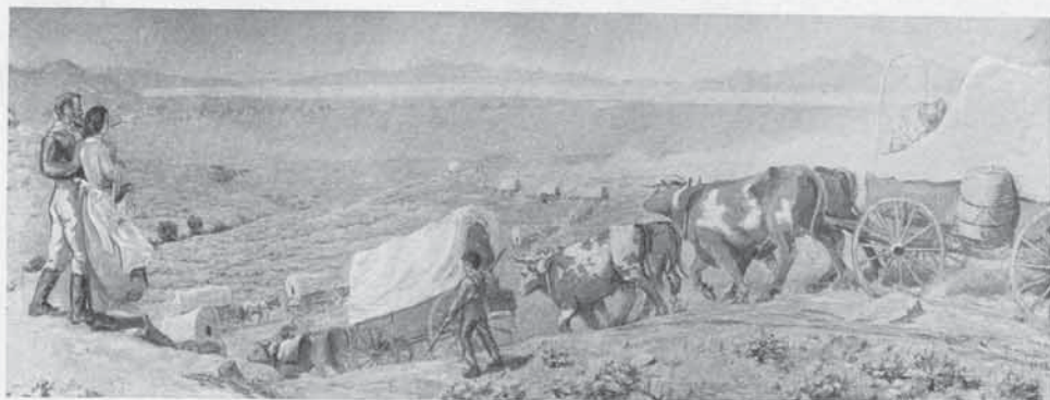
The Pioneers Entering Salt Lake Valley

The third picture represents "Winter Quarters." The saints were here afflicted with sickness, disease, and death. The mother is placing a twig of green on the grave of her child while the father stands dejectedly near her. The mother of the author of this beautiful mural buried four of her loved ones here. The shadow in the foreground of the man digging the grave vividly expresses the haunting memories of this pioneer family.