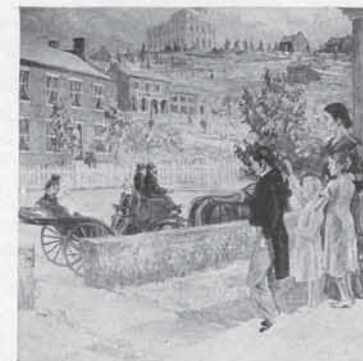
Nauvoo the Beautiful

The central figure in the sculpture represents the fundamental ideal in Mormon religion that progress is eternal. Before man was born upon this earth he lived as an individual having a spiritual body substance. He was conscious and self-acting. He chose the good or he chose the evil. This spirit body is not immaterial, but is composed of a much more subtle and refined substance than flesh and bones, and is intelligent. Progress was made in that pre-mortal state.