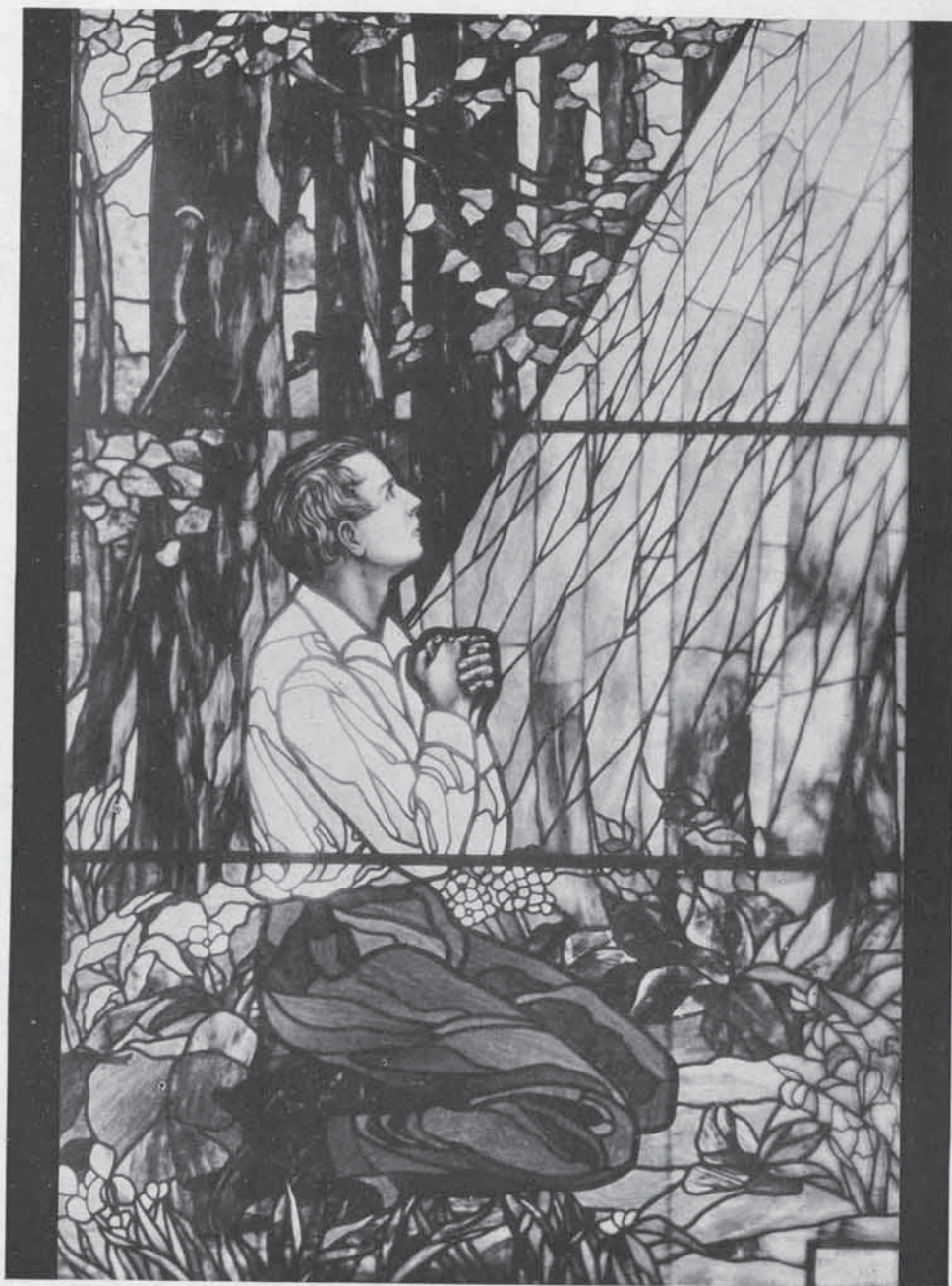
Joseph Smith's First Vision