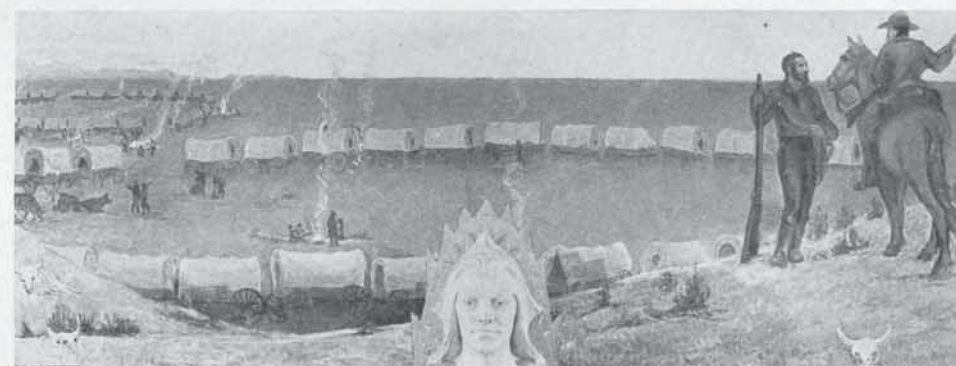
The Encampment on the Plains