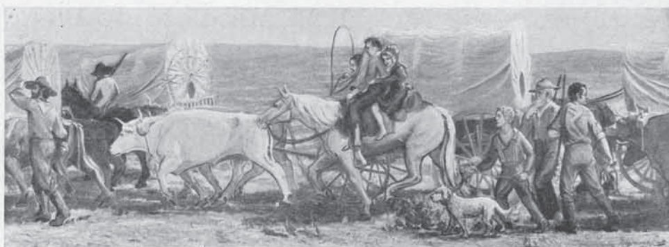
The Pioneer Train on March to the West

Standing next to the nurse is the Scientist studying the changes in his test tube. Mormonism teaches that all truth from whatever source is part of the Gospel of Jesus Christ. The truths of Science are a fundamental part of this religion. There can be no