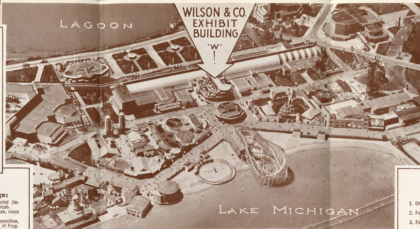
BIRD'S-EYE VIEW OF THE 1934 CENTURY OF PROGRESS—FRONTING LAKE MICHIGAN